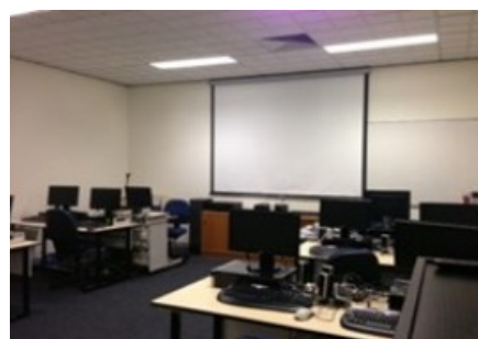
Training Room for 12