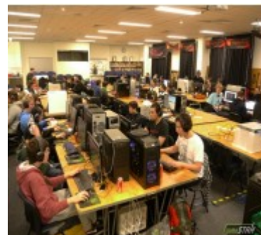
Main Conference Room set up for Gaming

Prices subject to change. Further options available. Melbourne PC Members receive 10% discount.